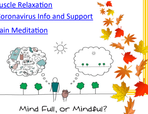
Mind Full, or Mindful?